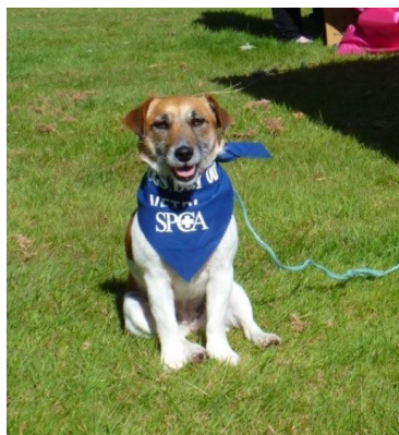
Dogs Day Out in Rotorua on the 13th of November 2011

The sun was shining, the dogs and owners arrived and a great morning was had by all. The VETPlus Dogs Day Out was once again a huge success and we had close to 250 dogs turn out for the annual event held in Rotorua. All money raised goes to the Rotorua SPCA and this year we totalled $3300.00!!